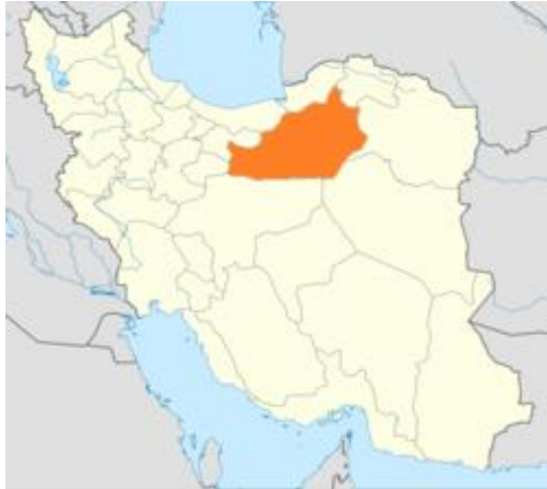
Location of Semnān within Iran

Semnan Province (Persian: استان سمنان, Ostān-e Semnān ) is one of the 31 provinces of Iran. It is in the north of the country, and its center is Semnan . The province of Semnan covers an area of 96,816 square kilometers and stretches along the Alborz mountain range and borders to Dasht-e Kavir desert in its southern parts.